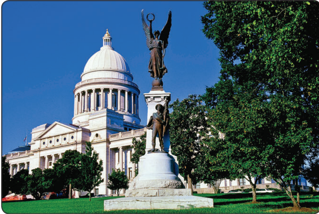
Arkansas State Capitol Building; Little Rock, AR